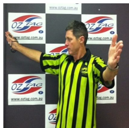
Off side (Stage 3)