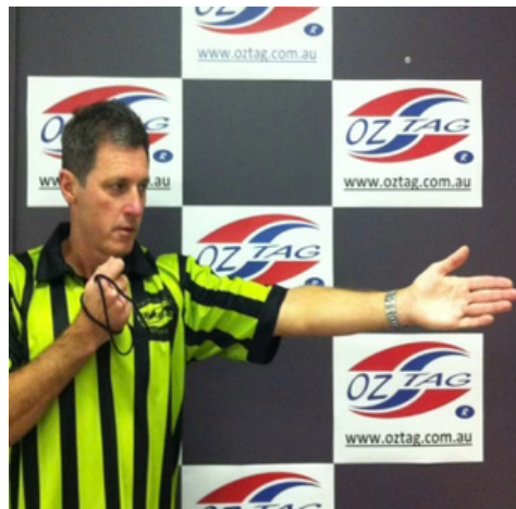
Forward Pass (Stage 2)