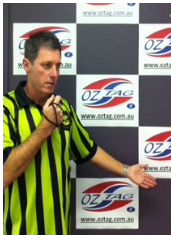
Forward Pass (Stage 1)