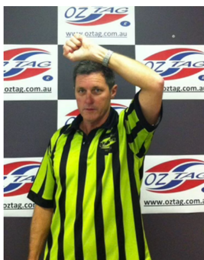
6 again (Stage 1)