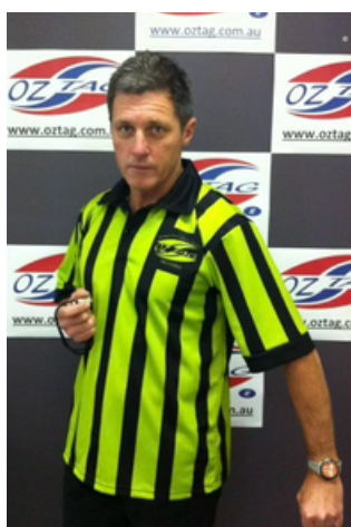
Late Tag (Stage 2)