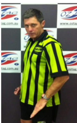
Fend (Stage 2)