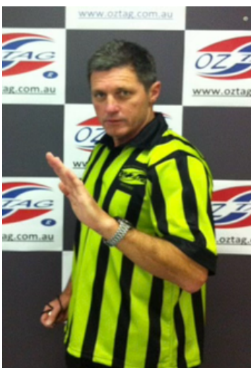
Fend (Stage 1)