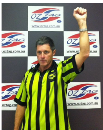
6 again (Stage 2)