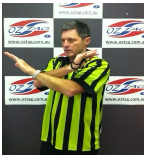
End of Game (Stage 1)