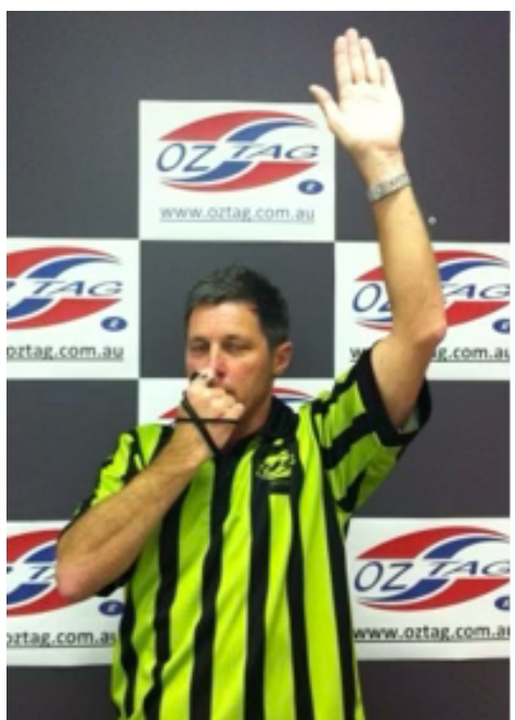
Stop Play (Stage 1)