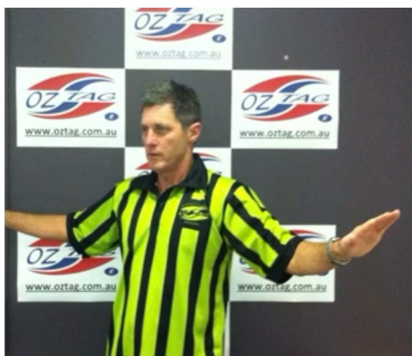
End of Game (Stage 2)