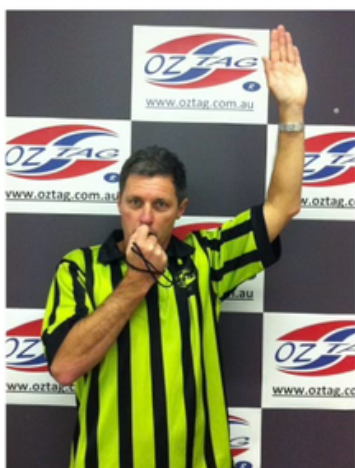
Kick off – commence game