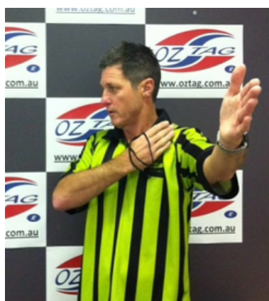
Off side (Stage 1)