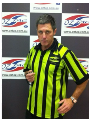
Late Tag (Stage 1)