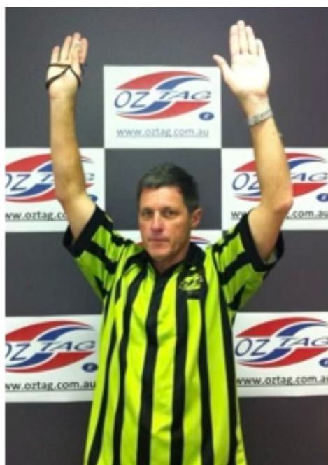
Stop Play (Stage 2)