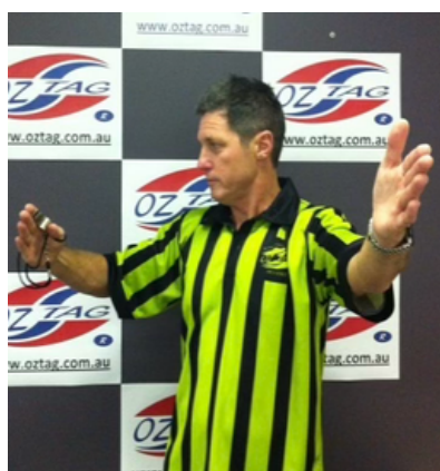
Off side (Stage 2)