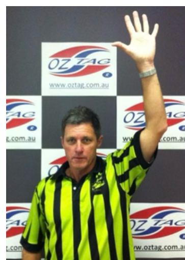
5th & Last